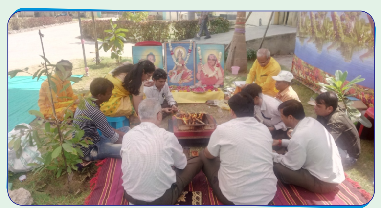
Gayatri Havan is an intensive way of chanting Gayatri mantra which creates a conscious flow of subtle energy. A Pooja Held at Jhagadia Pumping Station.