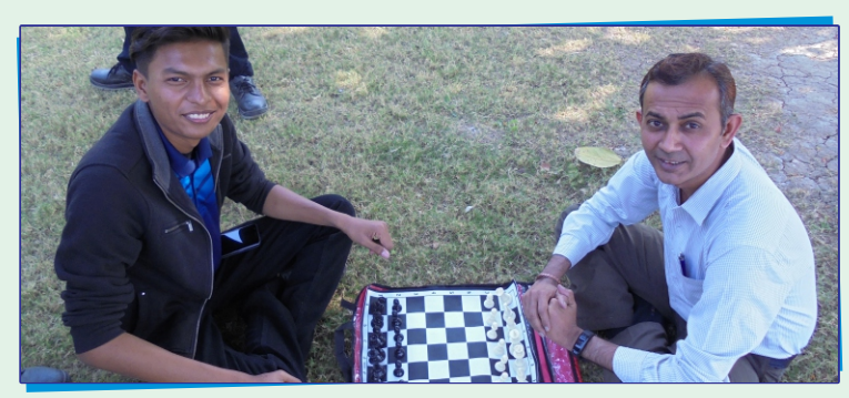
Playing Chess-improves the learning, thinking, analytical power, and decision - making ability.