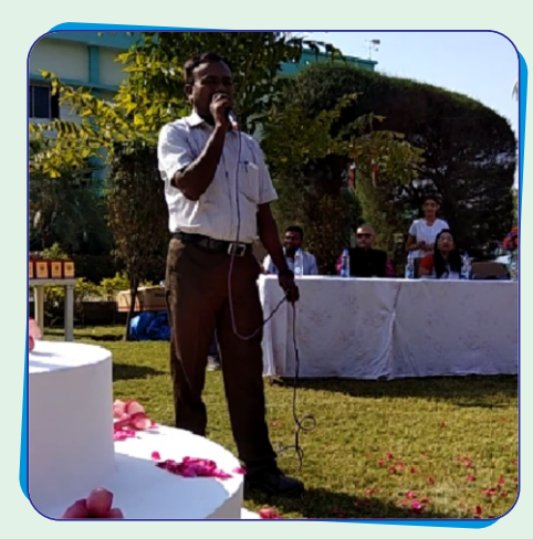
He is not just a mimicry artiste; He blends it with stand-up comedy. A script written by him on the burning issues of water pollution.