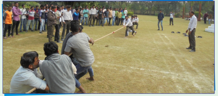
The objective is to win by pulling the opposition through working together, encouraging true cooperation and team discipline.