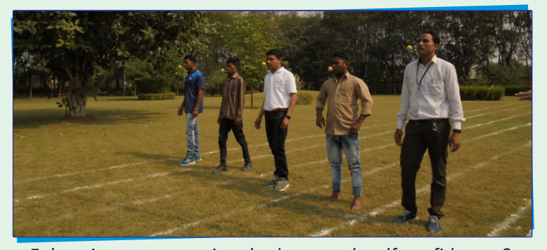
Enhancing concentration, body control, self-confidence & attention with fun-Lemon Spoon