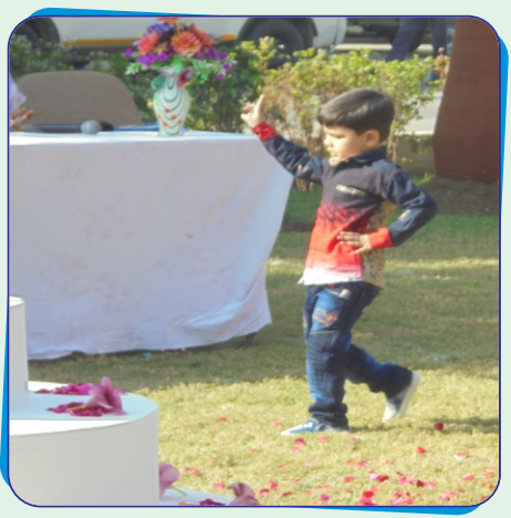
Dance is not just a physical phenomenon, it's a social, cultural, and historical product. Employees' children captivated the audience by their performance