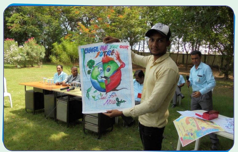
The talented participants of poster and slogan competition were awarded prizes on the occasion of 45th world environment day.